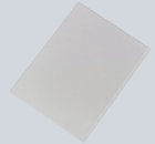
Carrier sheet KV-SS076

*100 - 600 dpi (1 dpi step) (B/W and Colour)